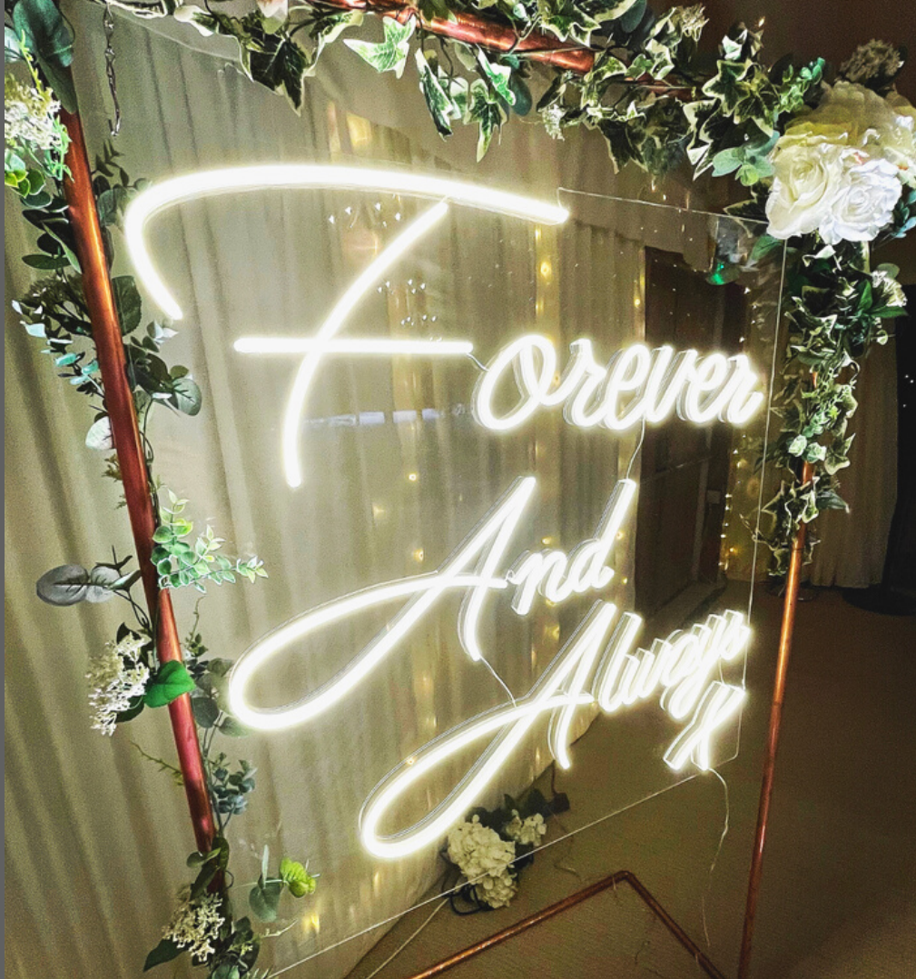
Neon sign 'Forever And Always' display

Standing 6ft tall our custom made warm lighting neon display can add that modern feel to your wedding.